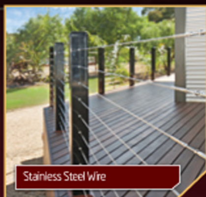
Stainless Steel Wire