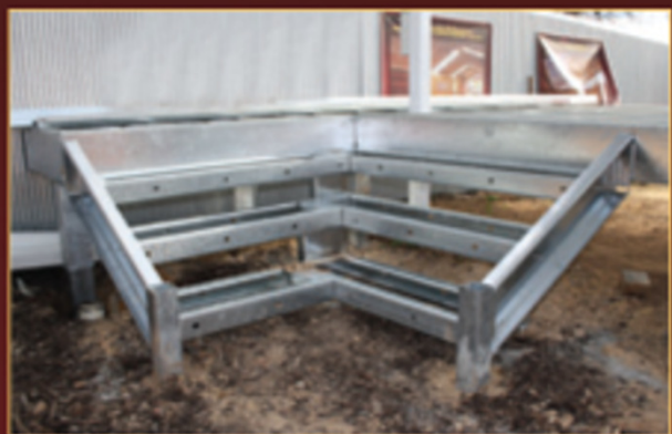
(BEFORE) Steel Frame Sub Floor

The system is ideal for decking, and suits cladding with a wide range of particleboard, hardwoods and composite products.