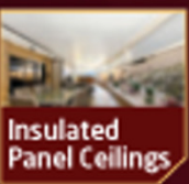
Insulated Panel Ceilings