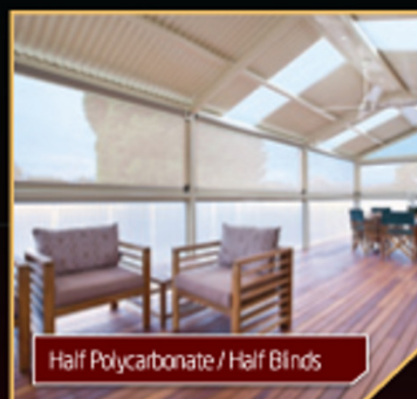
Half Polycarbonate / Half Blinds